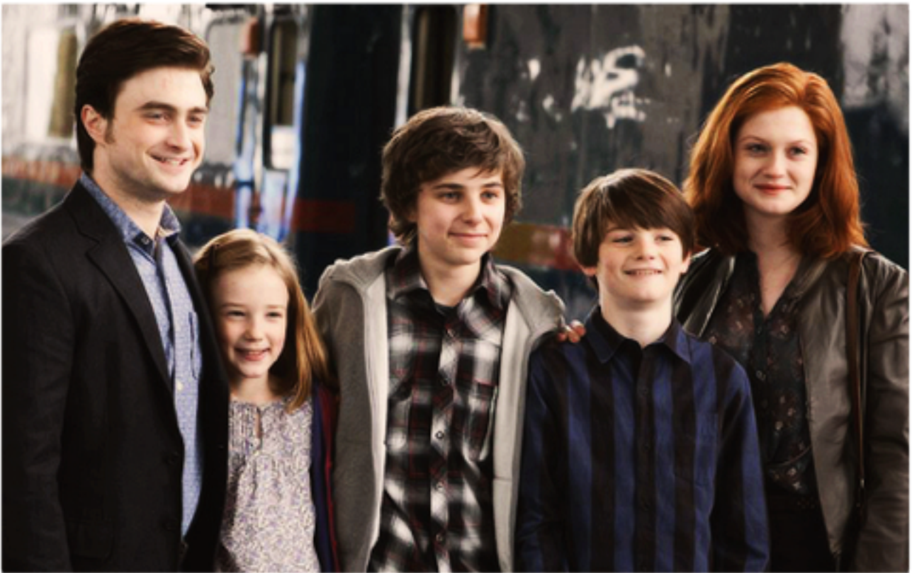
From left to right: Harry Potter with daughter Lily, sons James and Albus and wife Ginny. Pictured here on Albus's first trip to Hogwarts

Harry married his long term girlfriend, Ginevra (Ginny) Weasley, and had three children. James Sirius Potter (after his father and godfather), Albus Severus (after the two most respectable headmasters of Hogwarts) and Lily Luna (after his mother and childhood friend Luna Lovegood).