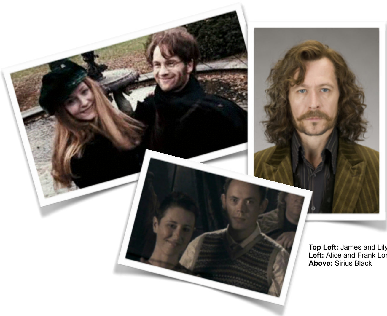
Top Left: James and Lily Potter Left: Alice and Frank Longbottom Above: Sirius Black

On October 31st 1981, Halloween, Lord Voldemort stormed the Potter house in Godric's Hollow and murdered both of Harry's parents. Luckily something happened when Lord Voldemort turned his wand to Harry and the curse rebounded, banishing Voldemort. All Harry was left with was a lightning bolt shaped scar above his right eye and the infamy of 'killing' the evil lord Voldemort.