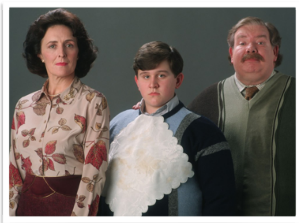
Above: Petunia, Dudley and Vernon Dursley

By ten, Harry was small for his age, underfed and unkempt due to only ever receiving his overly large cousin's castoffs/hand-me-downs.